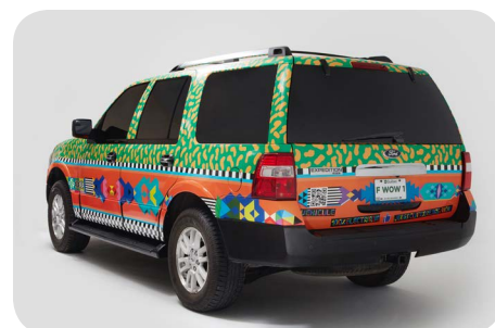
Transition Wow after-sales service converted truck