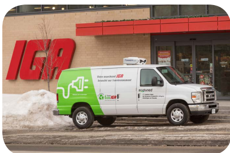
1 st 100% electric refrigerated delivery van converted in Canada