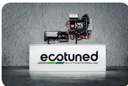
An innovative technology from Quebec