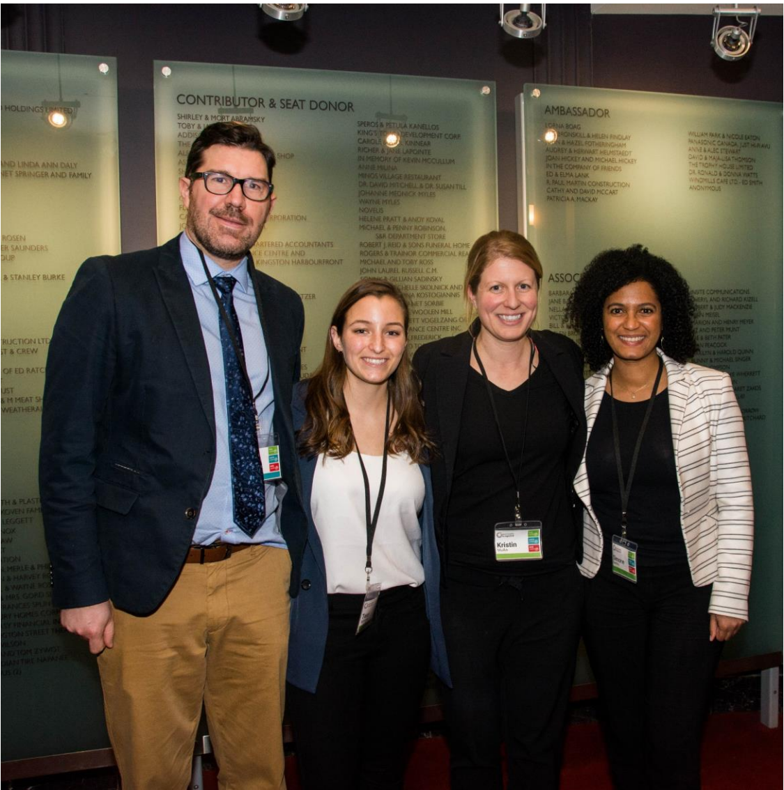
Sustainable Kingston Staff

It is difficult to have a perfectly sustainable event, but hopefully this guide has been a helpful resource and increased your event’s sustainability. If we all work together as a community to enhance the livability and resiliency of Kingston, we can have a more #SustainableYGBK.